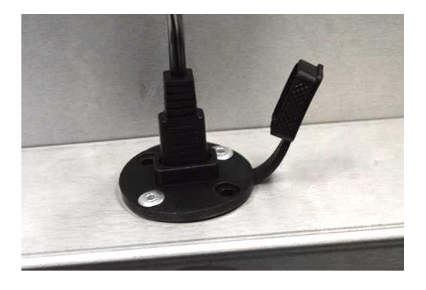
Charging Port with charging cable plugged in