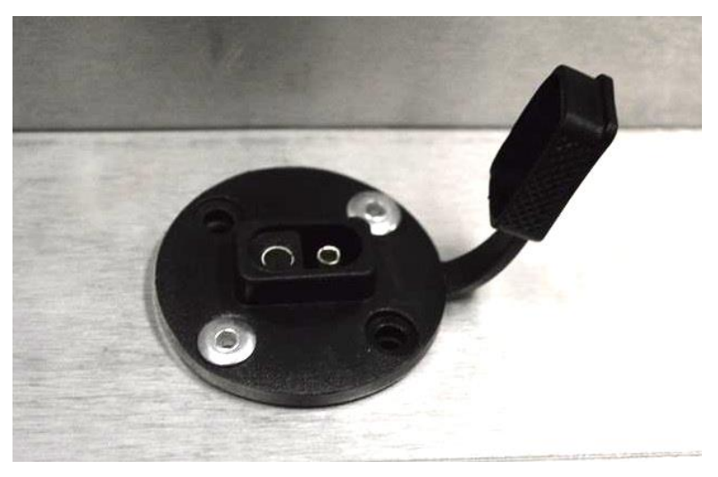
Charging Port with protective cap removed

To charge your Ergo Cart, plug the supplied charger into the charging port shown below and then plug it into the wall. The charger will display a red light while charging and change to green when finished. When it is finished, unplug the charger from the wall then unplug the charger from the cart. The charger has an overvolt protection feature so there is no danger of leaving it on the charger. However, to get the best performance out of the batteries, it is best to disconnect the charger once the batteries are fully charged.